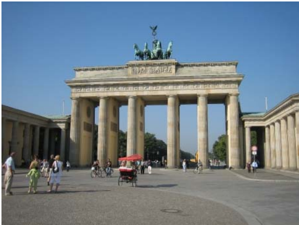
Berlin Capital of Germany