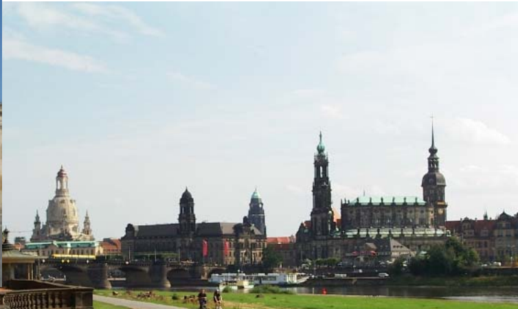
Prag (Praha) Capital of Czech Republic