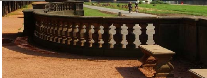
Dresden Capital of the German federal state Saxony